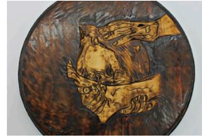
Wood Burning by Anonymous Donor

We invite you to consider supporting B TSR through our first online auction!